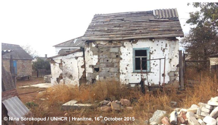
Hranitne, 16 th October 2015