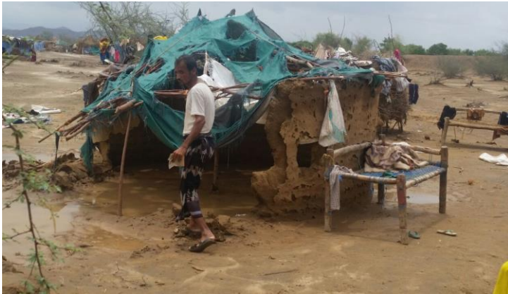
IDPs shelters damaged by the recent flooding in Abs district, Hajjah Governorate. August 2016.