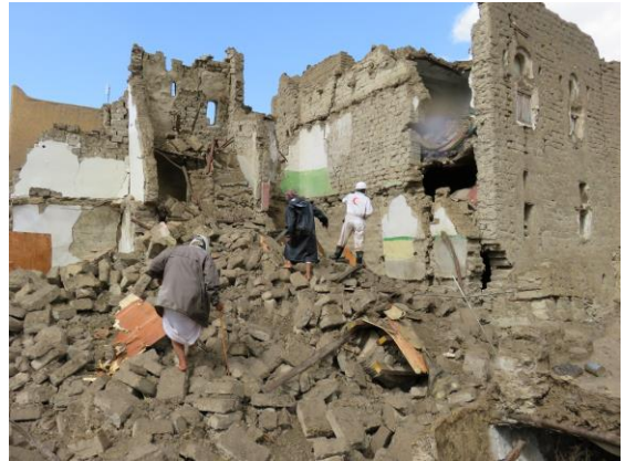
Houses damaged by recent flooding in Amran district, Amran Governorate. August 2016.